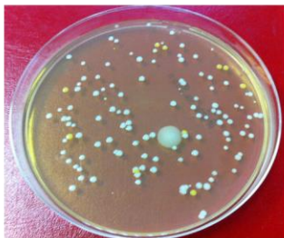
Commercially available Surgical Mask

After being worn for 30 min, the external surfaces of both a standard surgical mask and the Triomed Active Surgical & Medical Mask were tested for bacterial contamination.